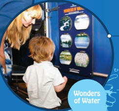
Wonders of Water