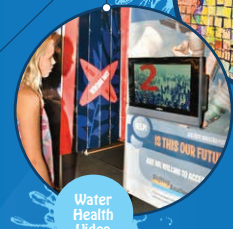
Water Health Video