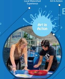
Art in Action