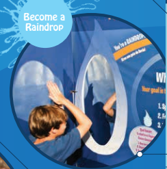
Become a Raindrop