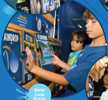
Water Cycle Puzzle