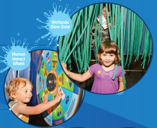
Human Impact Wheel