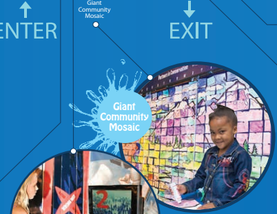
Giant Community Mosaic