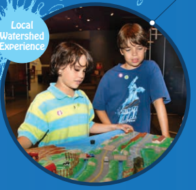
Local Watershed Experience