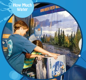
How Much Water