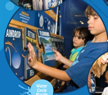
Water Cycle Puzzle