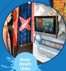
Water Health Video