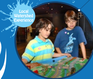
Local Watershed Experience