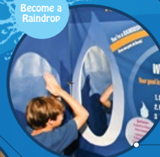
Become a Raindrop