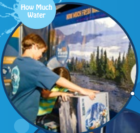
How Much Water