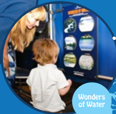
Wonders of Water