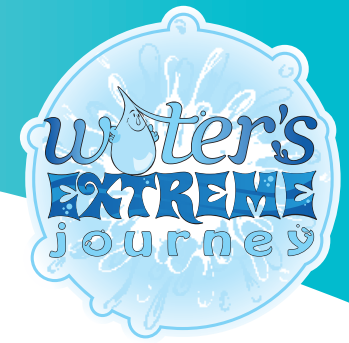
Exhibit Specs - Indoor Version