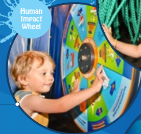
Human Impact Wheel