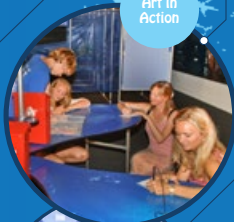
Art in Action