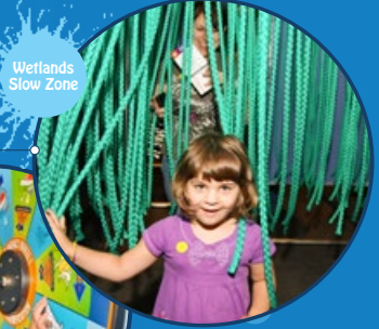
Wetlands Slow Zone